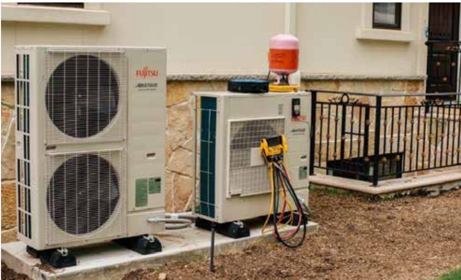
Two VRF units are installed on either side of the house, Fujitsu Airstage J-II and J-IIS.