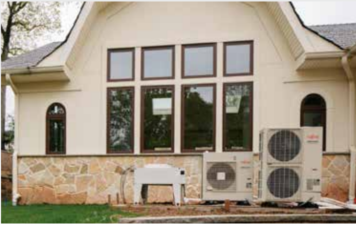
The condensing unit for the natatorium system is installed just outside the pool.

the Fujitsu Service Tool built into the SBC. This provides an in-depth technical view into the system as it operates, displaying all information such as all temperature readings, refrigerant pressure readings, compressor amperage, etc. Each is continually recorded.